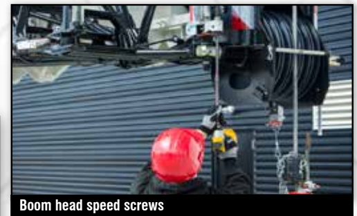
Boom head speed screws