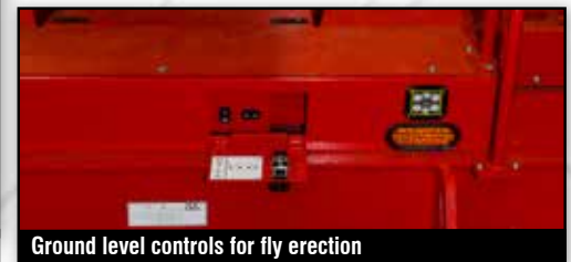
Ground level controls for fly erection