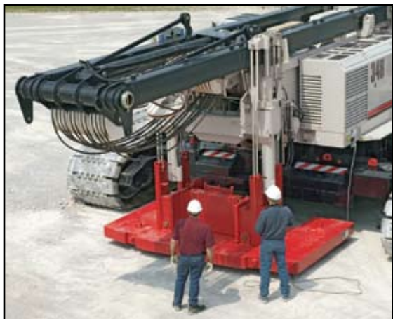
Counterweight removal mechanism self-removes for even lower main load transport weight where required.