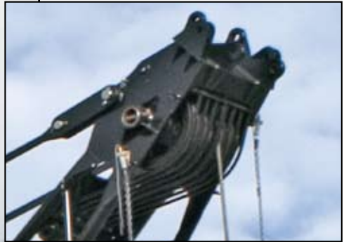
Long range tip