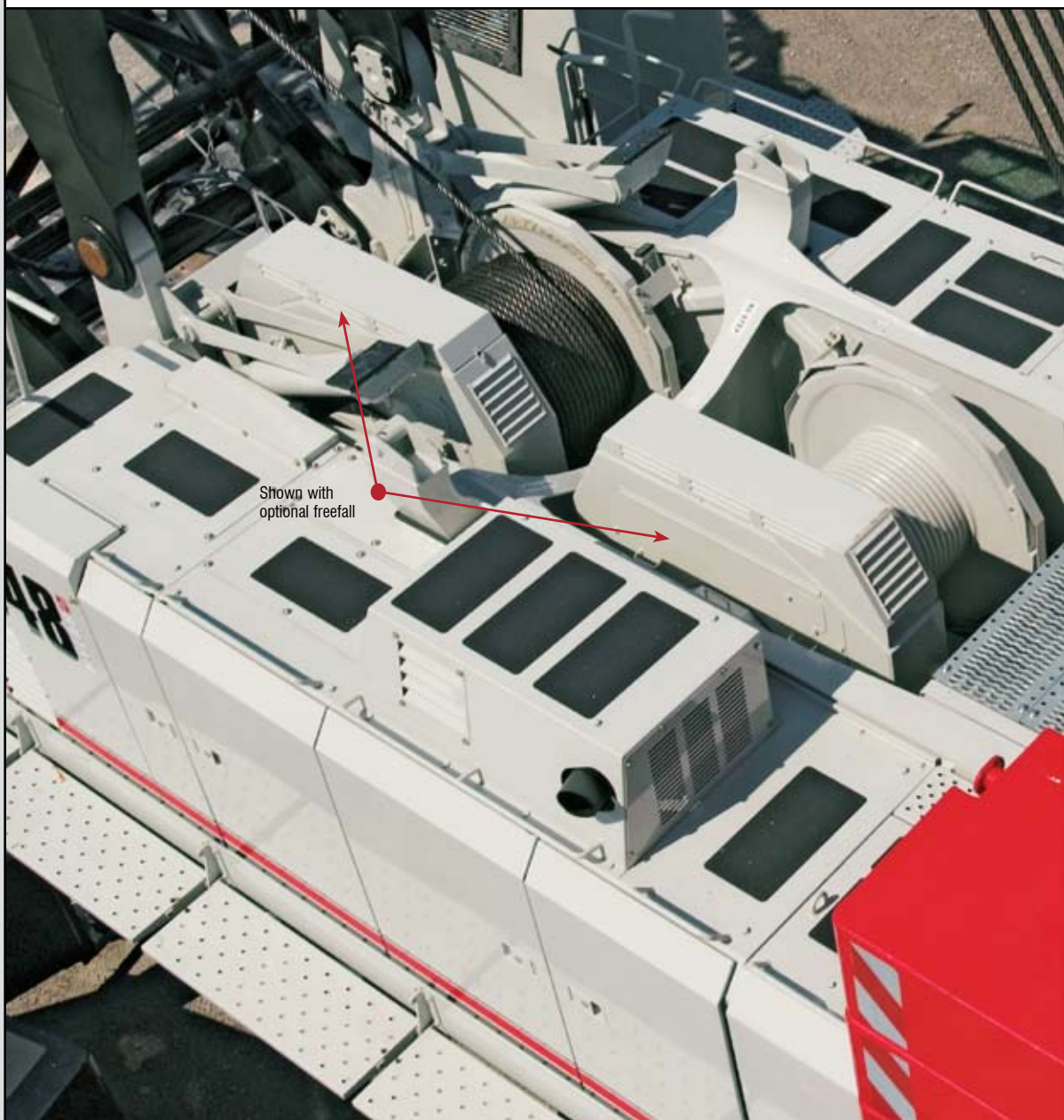
Shown with optional freefall