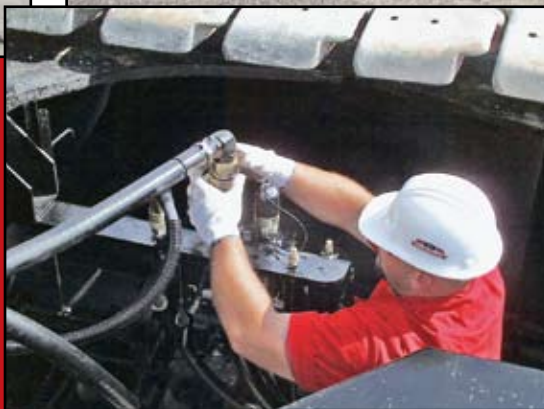
Crawler quick disconnects can attach in minutes — no tools required