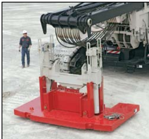
Counterweight removal mechanism detached